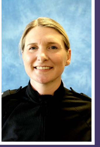
SOCIAL MEDIA Twitter -