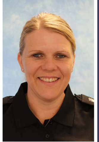
SOCIAL MEDIA Twitter -